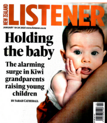
Left: GRG featured in the January 2025 listener article titled 'Holding the Baby'

Through our advocacy and frontline support, GRG provided key insights into the realities of raising grandchildren, highlighting the urgent need for better financial assistance, legal protections, and emotional support for whānau caregivers. We are grateful for the opportunity to amplify the voices of these incredible grandparents and to continue advocating for systemic change that ensures they receive the support they deserve.